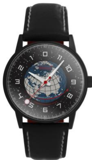
RAKETA "RUSSIAN CODE"