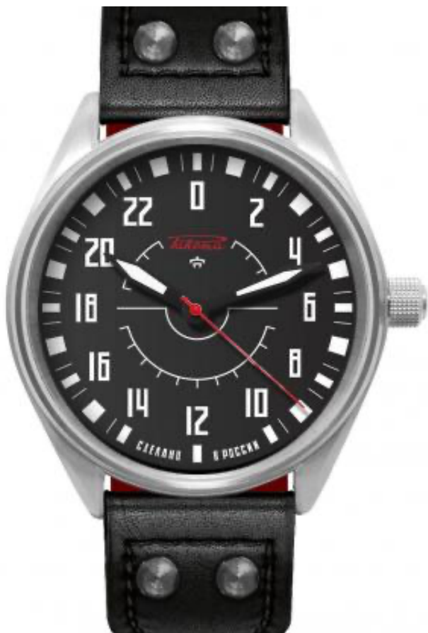
RAKETA TU ITEM 80