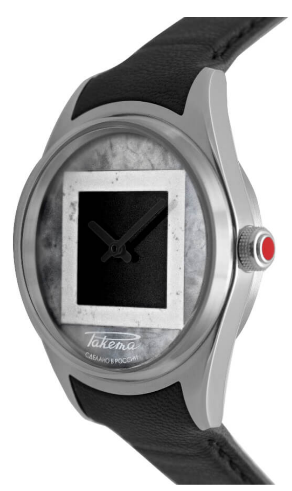
Raketa Big Zero Malevich Watch

Most people will not like this watch. But those who are ready to break-up from traditional classic and step into a new aesthetic reality created from Zero will love it. Exactly like the Black Square of Malevich.