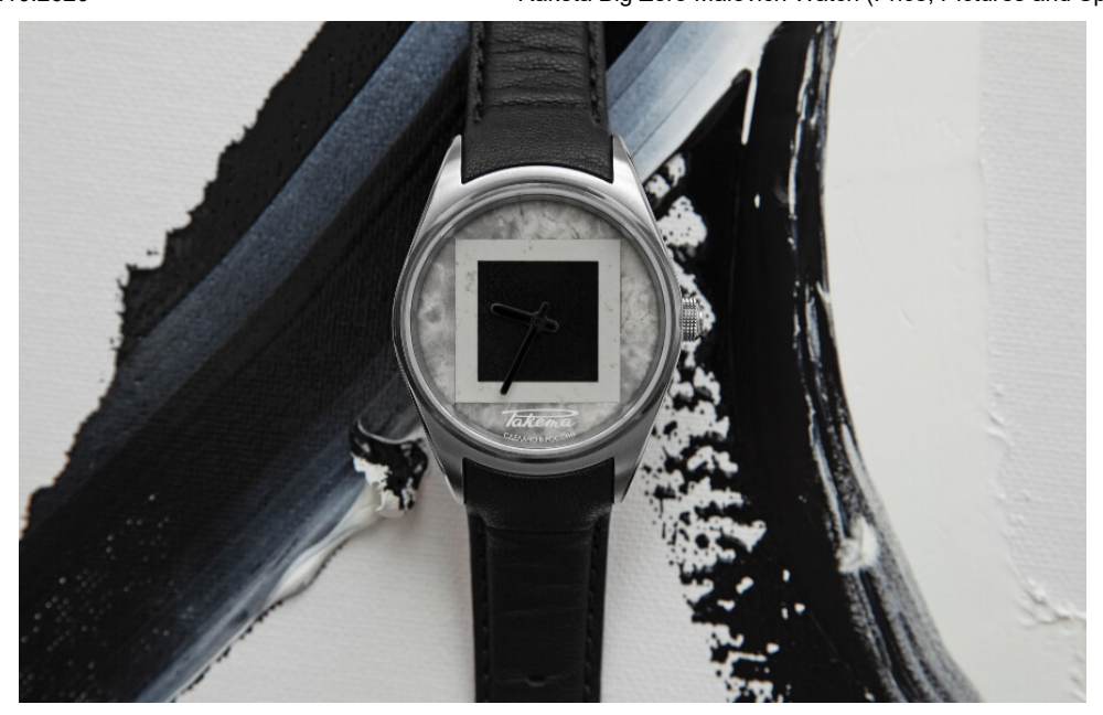
Raketa Big Zero Malevich Watch