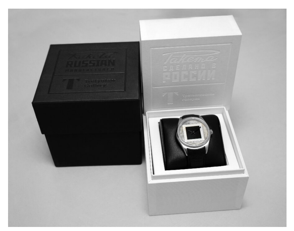
Raketa Big Zero Malevich Watch

The Raketa Big Zero Malevich watch model is released in a limited edition of 300 pieces. It is available on the official online and offline stores of the Raketa Watch Factory and at the official store of the State Tretyakov Gallery.