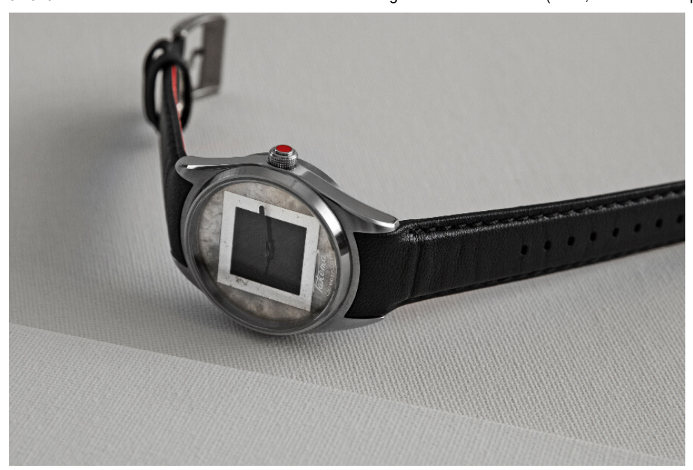
Raketa Big Zero Malevich Watch

The Raketa Big Zero Malevich watch model is released in a limited edition of 300 pieces. It is available on the official online and offline stores of the Raketa Watch Factory and at the official store of the State Tretyakov Gallery.