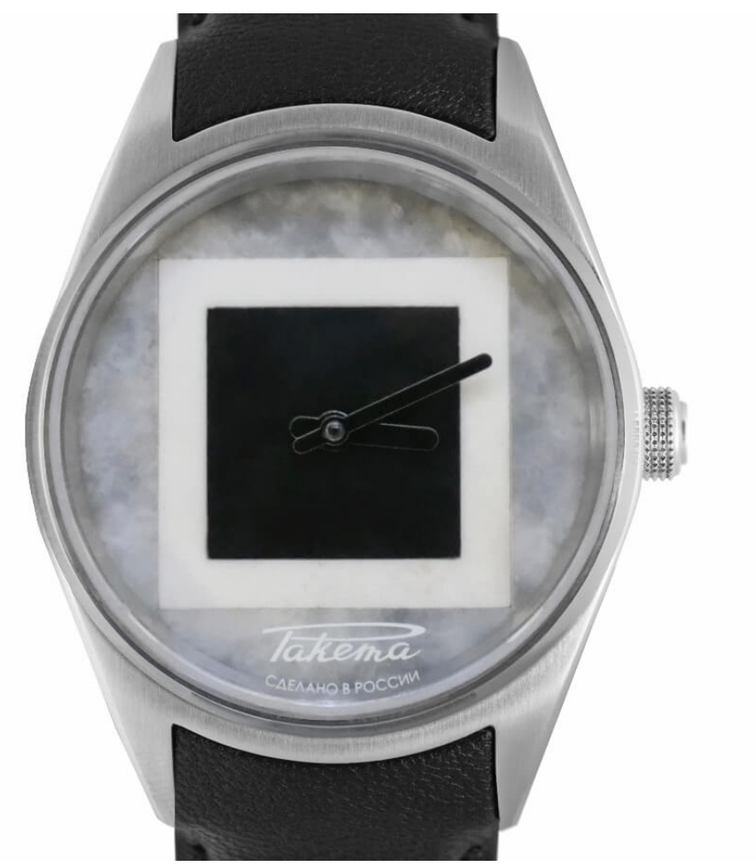
Raketa Big Zero Malevich Watch

They didn't try to do a beautiful watch. They did a radically abstract watch that doesn't follow the conventional rules of classic aesthetics. Exactly like the Russian Avant-Garde artist Kazimir Malevich did in 1915 when he painted the most abstract painting in the world: The Black Square.