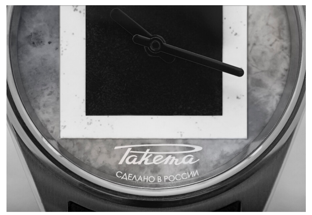
Raketa Big Zero Malevich Watch

Most people will not like this watch. But those who are ready to break-up from traditional classic and step into a new aesthetic reality created from Zero will love it. Exactly like the Black Square of Malevich.